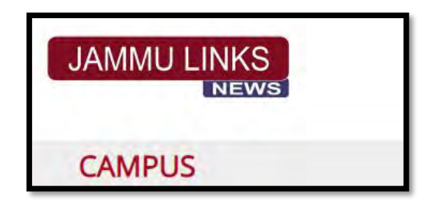
Friday 28<sup>th</sup> July 2023

Day 5 of IIM Jammu's Orientation Program hosts knowledge based inspiring sessions