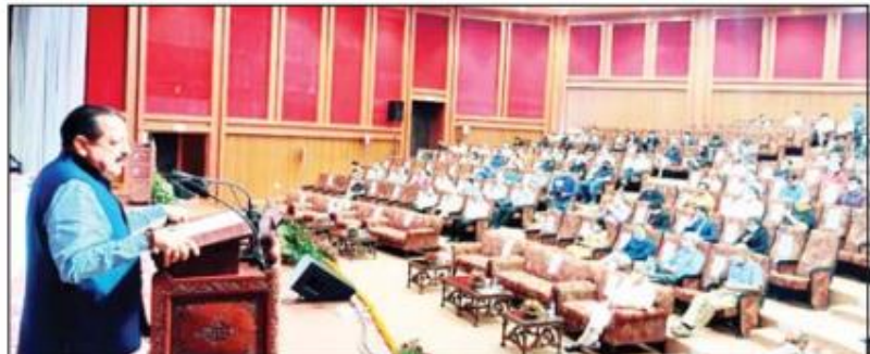
Union Minister Dr Jitendra Singh speaking during the signing of MoU among four institutions in Jammu on Saturday. Another pic on page 4.

on the 31st of August, Home Minister Amit Shah is going to launch a Web Portal for Registration of Units under the "New Central Scheme" for Industrial development of J&K. "This will also be optimally use-