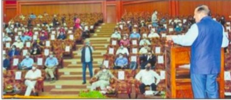
एमओयू साइन करने के अवसर पर संबोधित करते डॉ. जितेंद्र सिंह।