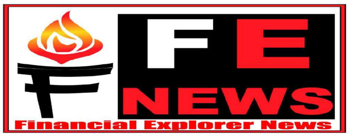
Tuesday, 12 March 2024

Setting the Course for Educational Excellence: IIM Jammu Inaugurates Leadership Training Program for College Principals of Jammu and Kashmir Jammu, March 11