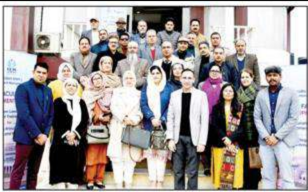
College Principals at training programme by IIM Jammu,