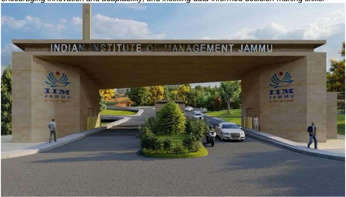
IIM Jammu conducts Faculty Development Programme

Under this faculty development programme, the institute will train the college principals in the implementation of the National Education Policy 2020 (NEP) in their institutes, enhancing instructional leadership, fostering effective communication, promoting cultural competence, encouraging innovation and adaptability, and instilling data-informed decision-making skills.