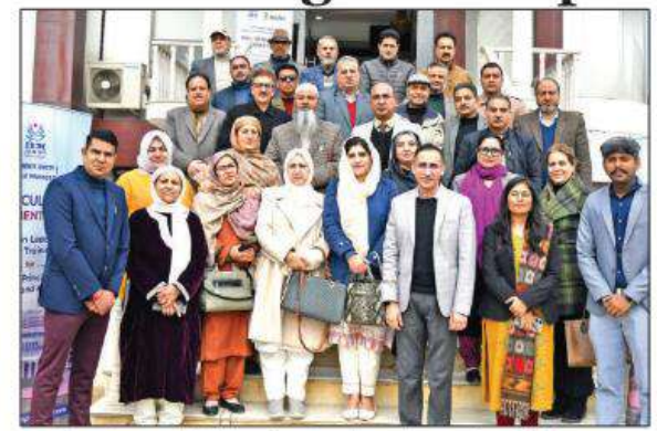
Participants of third batch posing for a photograph at IIM Jammu.

He emphasized that this program transcends mere coursework; it symbolizes a deep-rooted commitment to educational excellence and innovation. He urged participants to articulate their expectations,