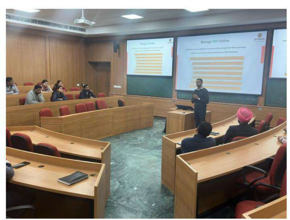
Indian Institute of Management (IIM) Jammu conducted a highly informative and engaging National Pension System (NPS) Subscriber Awareness Program on the 13th of December 2023.