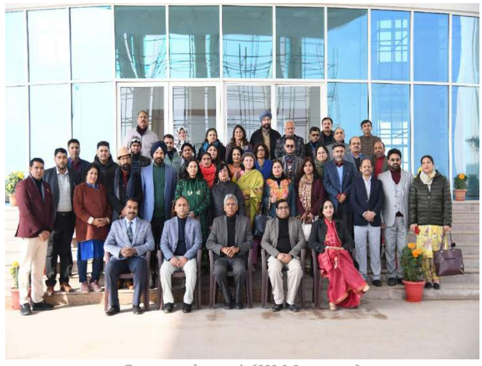
Group photo | (IIM Jammu)