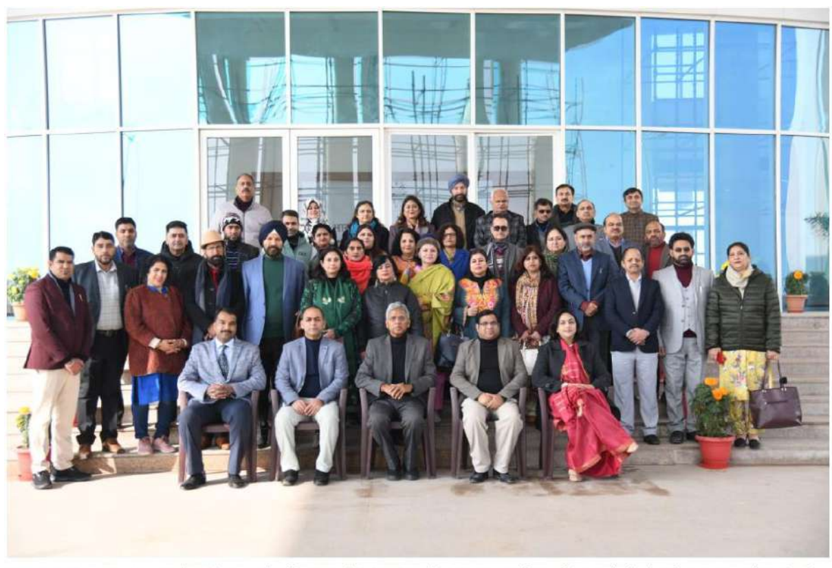
IIM Jammu Inaugurates Education Leadership Development Training Program for College Principals of Jammu and Kashmir.