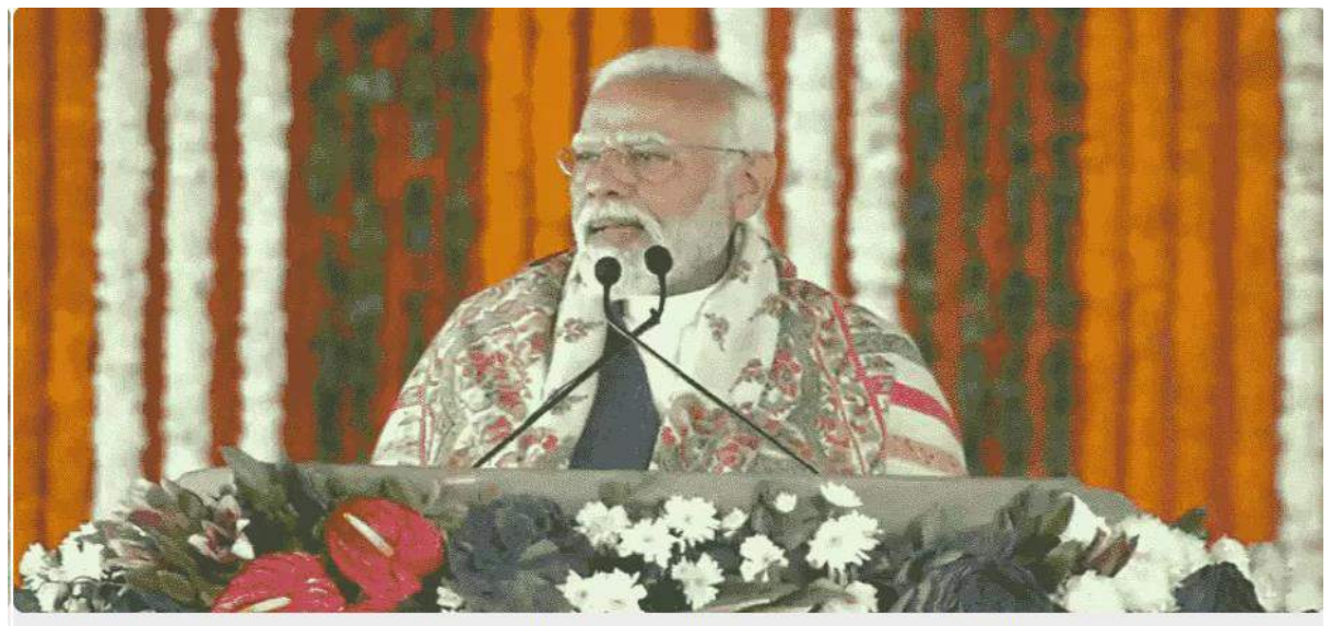
PM Modi inaugurated AliMS Jammu, permanent campuses of IITs, IIMs, IISER, central universities.

Listing the educational infrastructure projects in Jammu, the PM emphasized that the advancement of education and skill development sectors on such a scale was a distant reality ten years ago. "But, this is new India", he said, highlighting that the government indulges in maximum expenditure for the modern education of the present and future generations.