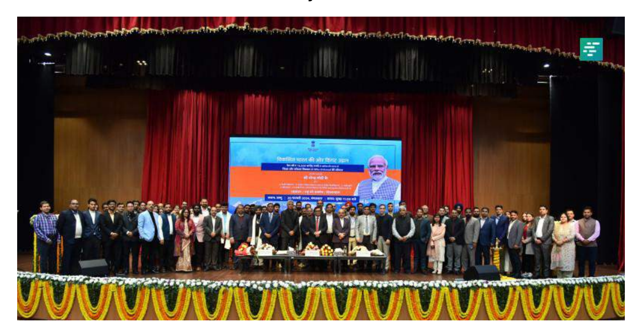
IIM Jammu Campus Inaugurated by Hon'ble Prime Minister of India, Shri Narendra Modi