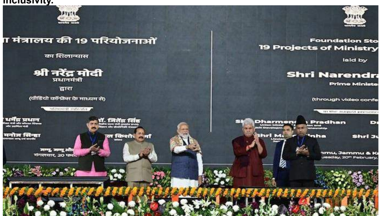
PM Modi inaugurates new IIM Jammu campus

During his visit to Jammu, Prime Minister Narendra Modi inaugurated the cutting-edge campus of the Indian Institute of Management (IIM). Situated on over 200 acres of land in Jagti, the IIM Jammu campus embodies the institute's dedication to offering top-notch management education and promoting inclusivity.