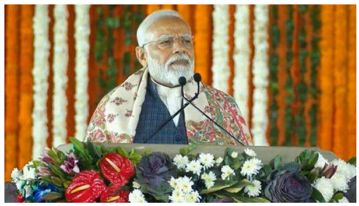
Prime Minister Narendra Modi during the inauguration & foundation stone laying ceremony of multiple developmental projects, in Jammu