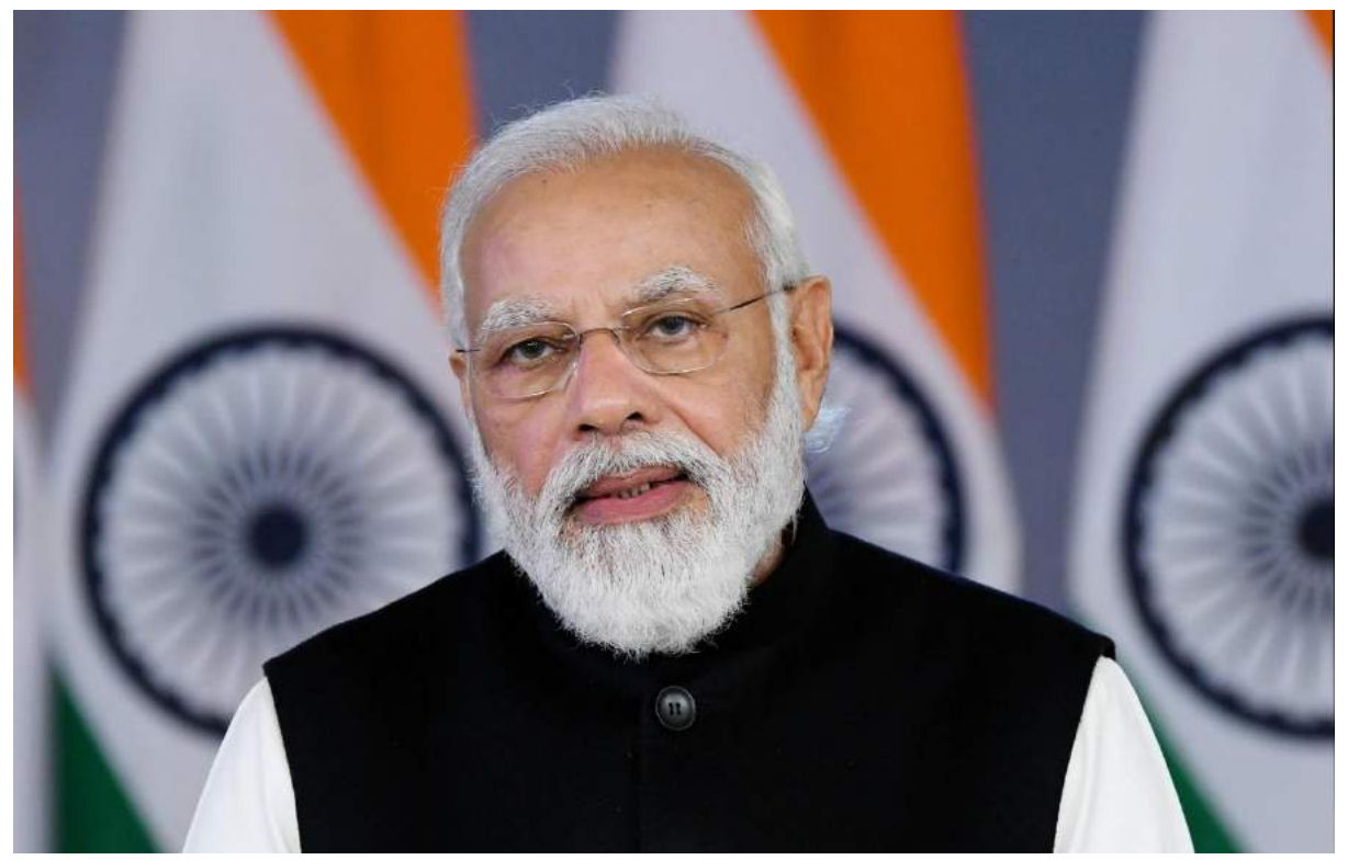
Prime Minister Narendra Modi

By FORTUNEINDIA.COM, Feb 20, 2024 3 min read