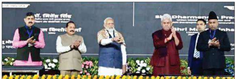
Prime Minister, Narendra Modi digitally inaugurating campus of IIM Jammu.