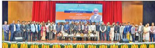
PM Narendra Modi virtually inaugurating state-of-the-art campus of the IIM from Jammu.