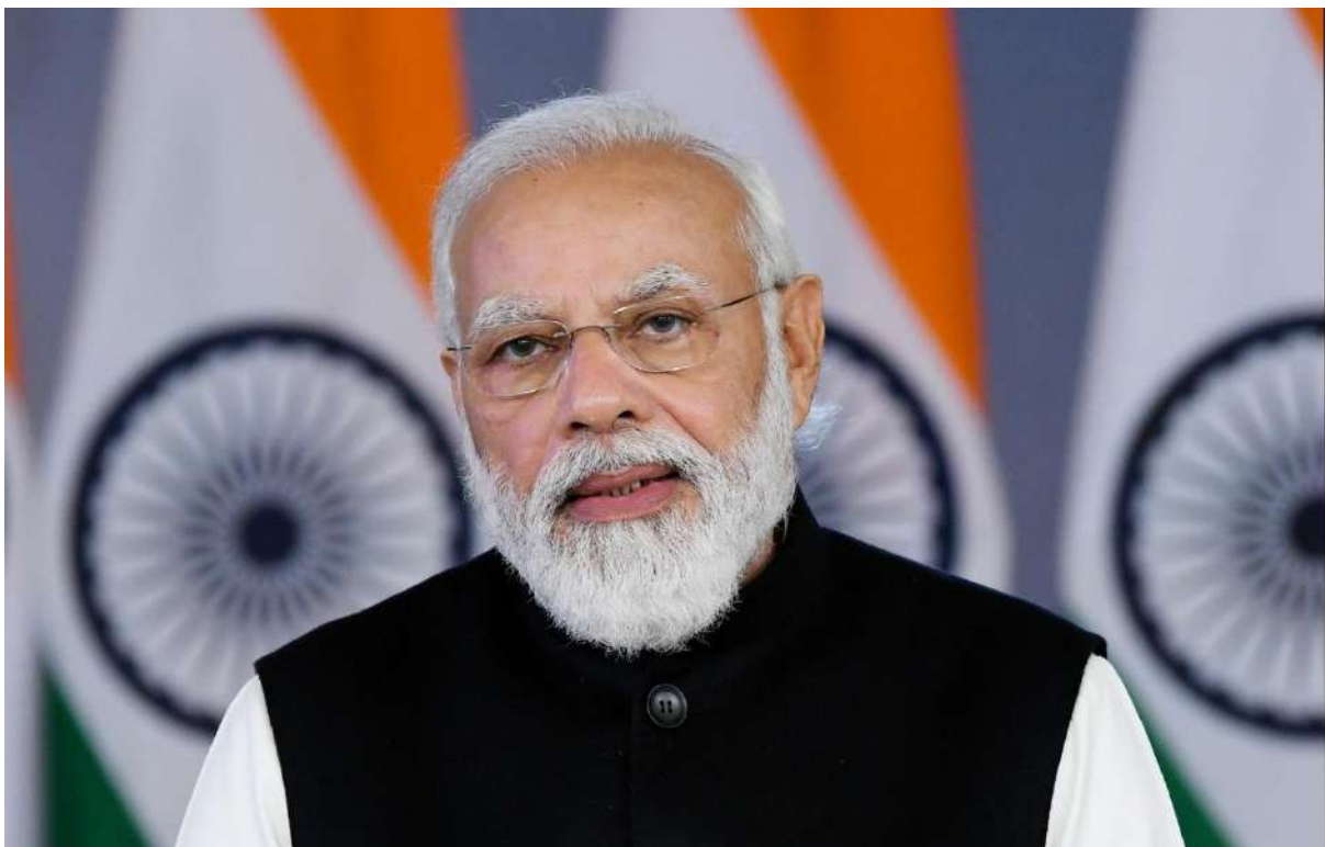
Prime Minister Narendra Modi

By FORTUNEINDIA.COM , Feb 20, 2024 3 min read