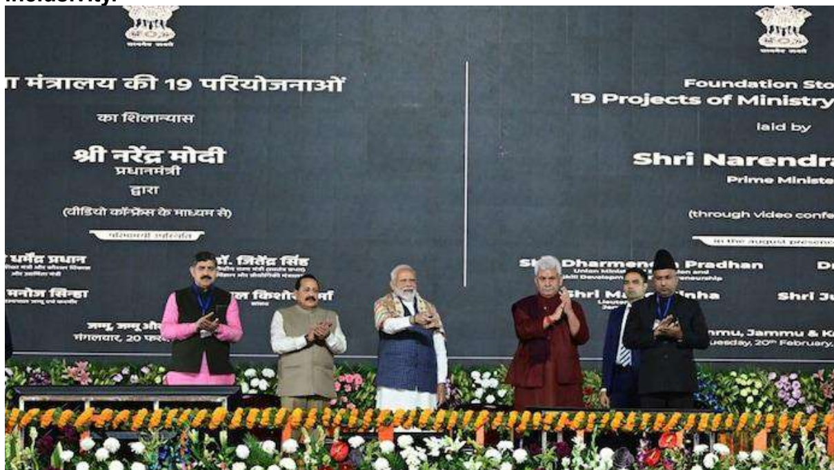
PM Modi inaugurates new IIM Jammu campus

During his visit to Jammu, Prime Minister Narendra Modi inaugurated the cutting-edge campus of the Indian Institute of Management (IIM). Situated on over 200 acres of land in Jagti, the IIM Jammu campus embodies the institute's dedication to offering top-notch management education and promoting inclusivity.