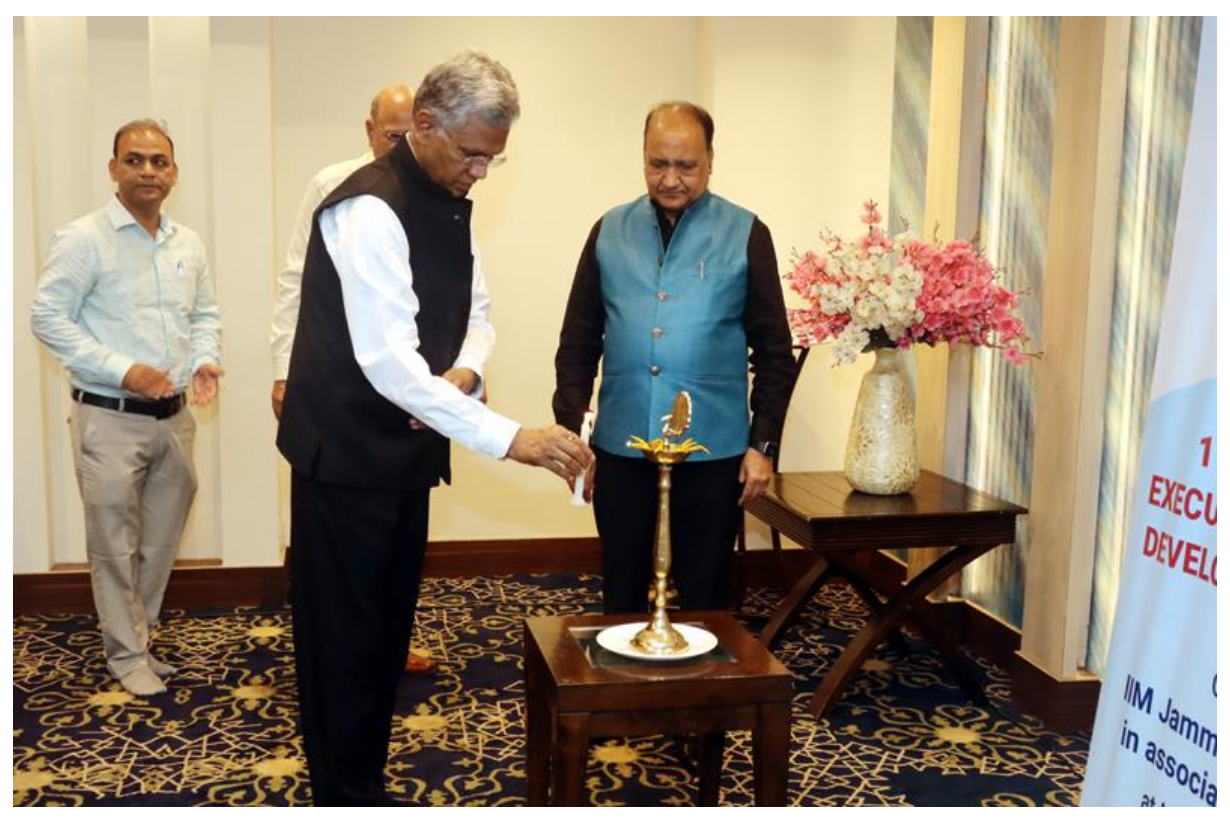
A dignitary lights ceremonial lamp to inaugurate Healthcare Executive Management Development Programme in Jammu.