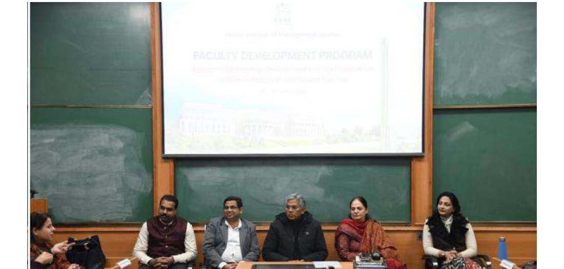
IIM Jammu's Education Leadership Training Programme

By Editor Desk - January 13, 2024 4:36 pm