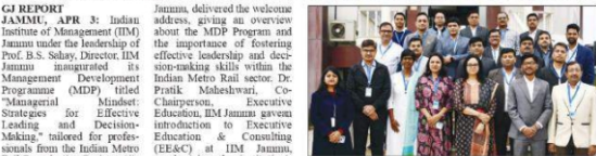
Participants posing for a group photograph at IIM Jammu.

JAMMU. The Indian Institute of Management (IIM) Jammu, under the aegis of the Ministry of Skill Development & Entrepreneurship (MSDE), Government of India, in collaboration with Dalit Indian Chamber of Commerce (DICC), commenced the fourth batch of the Capacity Building Program (CBP) on Small Business Development Units (SBDUs).