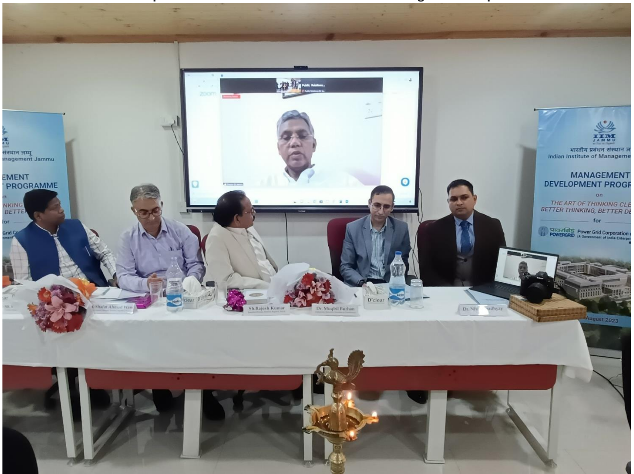
Glimpses from the MDP of PGCIL-IIM Jammu Srinagar Off Campus