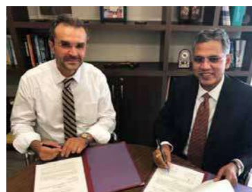
MoU signing ceremony with Montpellier Business School, France