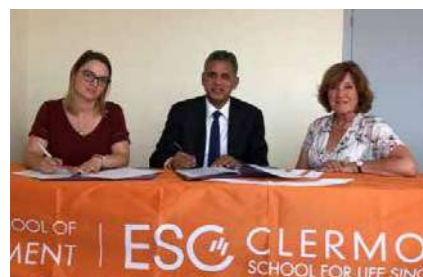
MoU Signing ceremony for ESC Clermont, France

SolBridge International School of Business, South Korea