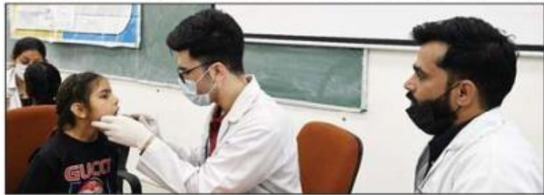
Doctors examining a child in a free eye and dental check-up camp at IIM Jammu