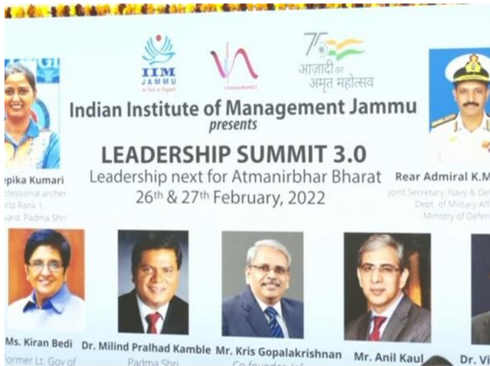
Visuals from IIM Jammu "Leadership Summit" (Photo/ANI). Image Credit: ANI

ANI | Jammu (Jammu And Kashmir) | Updated: 27-02-2022 03:51 IST | Created: 27-02-2022 03:51 IST