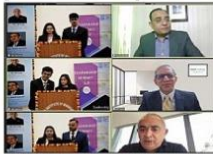
Dignitaries during a Leadership Summit launched by IIM Jammu.