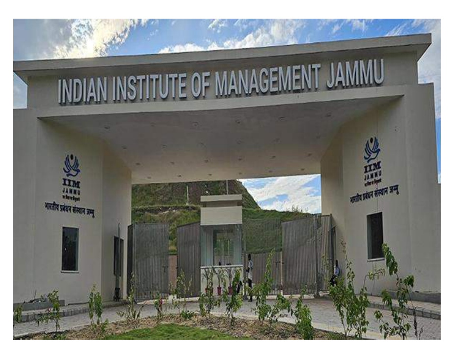
Indian Institute of Management (IIM), Jammu.

ammu (Jammu and Kashmir) [India], April 4 (ANI): Indian Institute of