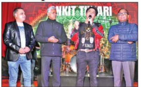
Bollywood sensation Ankit Tiwari performing at IIM Jammu.

The second day of Empyrean 2024 featured a dynamic lineup of events designed to engage and entertain participants. The