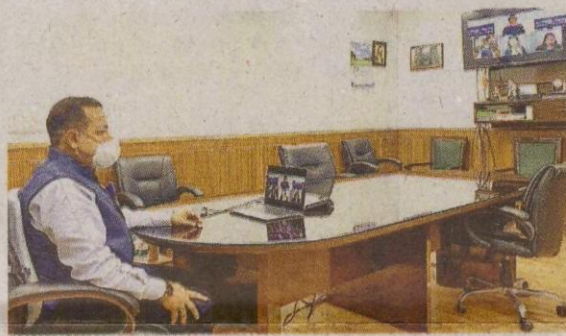
जम्मू आइआइएम में नए बैच का उद्घाटन करते डॉ. जितेंद्र सिंह

डॉ. सिंह वीरवार को जम्मू के केनाल रोड स्थित इंडियन इंस्टीट्यूट ऑफ मैनेजमेंट में पीएचडी के पहले बैच व एमबीए के पांचवें बैच के ऑनलाइन उद्घाटन समारोह में विचार व्यक्त कर रहे थे। दिल्ली से वीडियो कॉन्फ्रेंसिंग के माध्यम से नए कोर्सों का उद्घाटन करने के बाद डॉ. सिंह ने कहा कि छह वर्षों के दौरान जम्मू में राष्ट्रीय स्तर के सात शिक्षण संस्थान स्थापित होना क्षेत्र के लिए बड़ी उपलब्धि है। केंद्र के वित्तीय सहयोग से चलने वाले 10 अन्य शिक्षण संस्थान स्थापित हुए हैं। जम्मू डिवीजन में इंडियन इंस्टीट्यूट ऑफ मैनेजमेंट, इंडियन इंस्टीट्यूट ऑफ टेक्नोलॉजी, आल इंडिया इंस्टीट्यूट ऑफ मेडिकल साइंस, हाई अल्टीट्यूड मेडिसिन इंस्टीट्यूट, बायोटेक इंडस्ट्रियल पार्क, इंडियन इंस्टीट्यूट ऑफ मास कम्युनिकेशन स्थापित होने का हवाला देते हुए डॉ. सिंह ने कहा इससे देश में जम्मू को अलग पहचान मिली है। इसके साथ प्रदेश में इंस्टीट्यूट ऑफ इंटेग्रेटिव मेडिसिन स्थापित होने