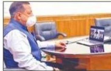
ऑनलाइन उद्घाटन करते डॉ. जितेंद्र।

केंद्रीय मंत्री ने आईआईएम जम्मू में नए बैच का किया ऑनलाइन उद्घाटन