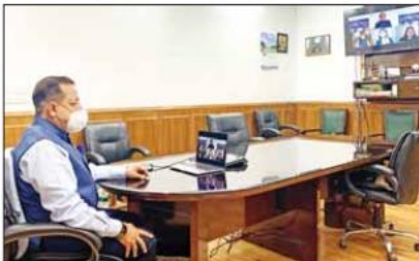
Union Minister Dr Jitendra Singh addressing online inaugural programme of the new batch of IIM Jammu, on Thursday.

Jammu, Dr Jitendra Singh recalled that in the last six years, Jammu has received six to seven academic institutes of national importance, in addition to nearly ten more centrally funded education institutions. The academic institutions of national importance allocated to Jammu Division include the Indian Institute of Management (IIM), Indian Institute of Technology (IIT), All India Institute of Medical Sciences (AIIMS), first-ever National Institute of High-altitude Medicine and North India's first Biotech Industrial Park cum Research Institution. Even though the Indian Institute of Mass Communication (IIMC) had started its regional centre around 2012-13 but the setting up of a permanent campus was undertaken under the present government and similarly the Indian Institute of Integrated Medicines (IIIM) was given a big boost by this govt with international collaboration projects.