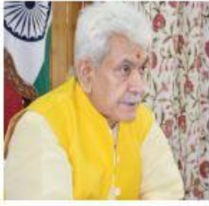
जम्मू। स्टेट समाचार

जम्मू-कश्मीर के सतत विकास को कम समय में 150 नई पहल शुरू की गई : एलजी