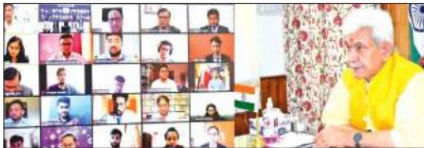
LG Manoj Sinha addressing students during inauguration of IIM Jammu's Online Orientation Programme at Thursday.

While congratulating all incoming students for making it into the academic programs of IIM Jammu, the Lt Governor advised them to