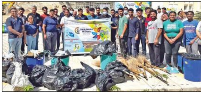
Cleanliness drive being carried out.